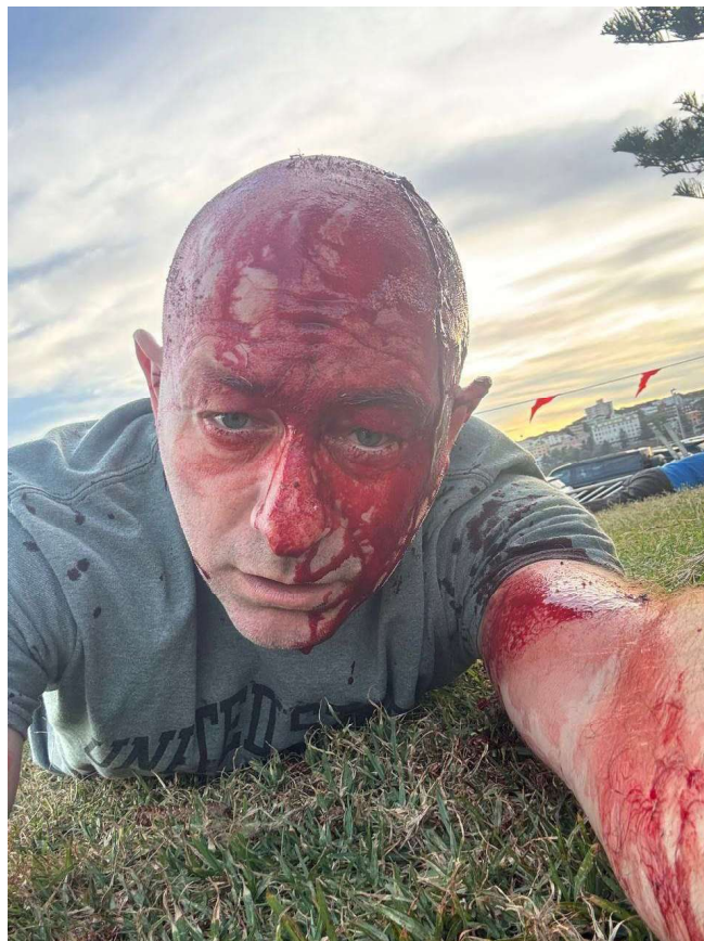
Figure 1. Image taken by Ostrovsky on his mobile phone shortly after the injury.

published at 21:59 on 14 December, was a straightforward factual report of injury, receiving 148,196 views and 543 forwards. This is significant: the highest-reach content was not conspiratorial. Narrative mutation began within minutes. Identity framing (references to “October 7, 2023”) appeared 2.6 minutes after the first injury mention. The tone of some early posts including Ostrovsky's picture (Figure 1) was insinuating.